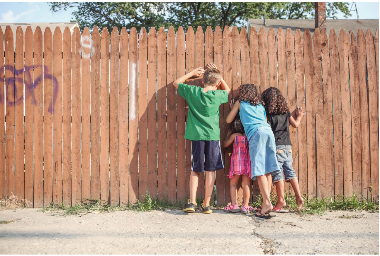
Growing in God's Love: A Story Bible Curriculum — Follow Me! © 2023 Westminster John Knox Press