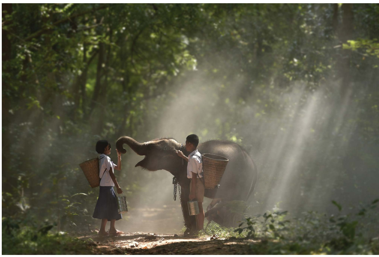
Growing in God's Love: A Story Bible Curriculum — Follow Me! © 2023 Westminster John Knox Press