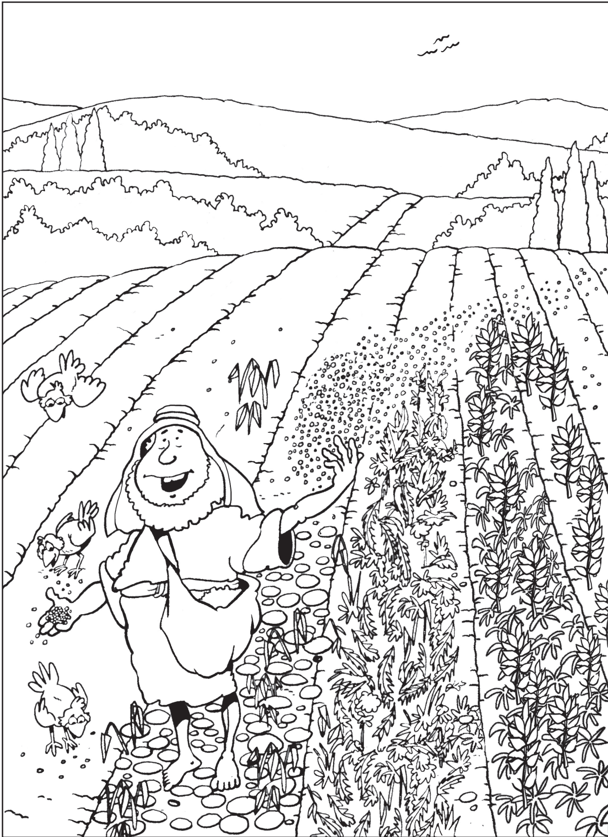
The farmer plants seeds that land on a dry path, rocky soil, weedy soil, and good soil.