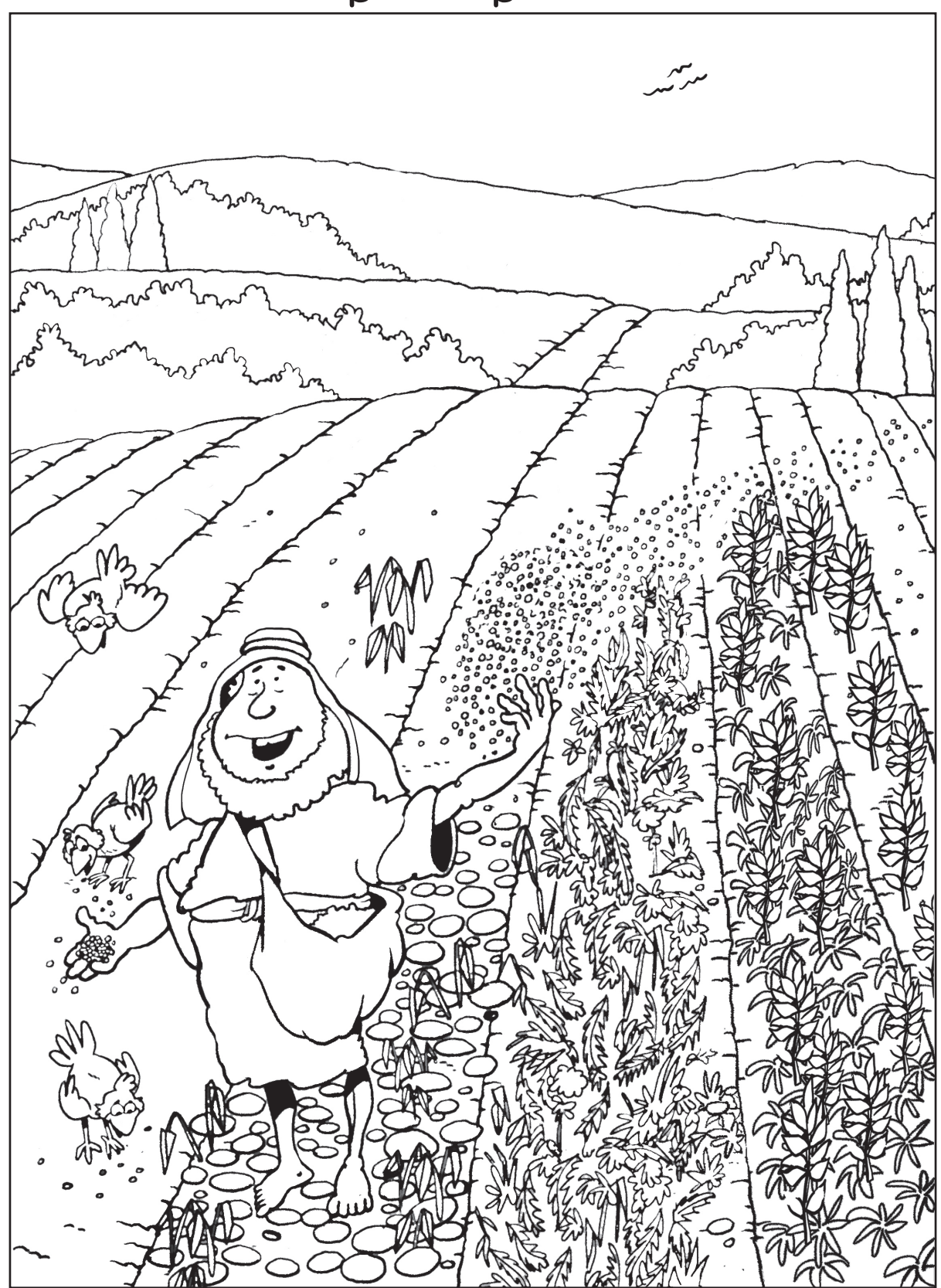
The farmer plants seeds that land on a dry path, rocky soil, weedy soil, and good soil.