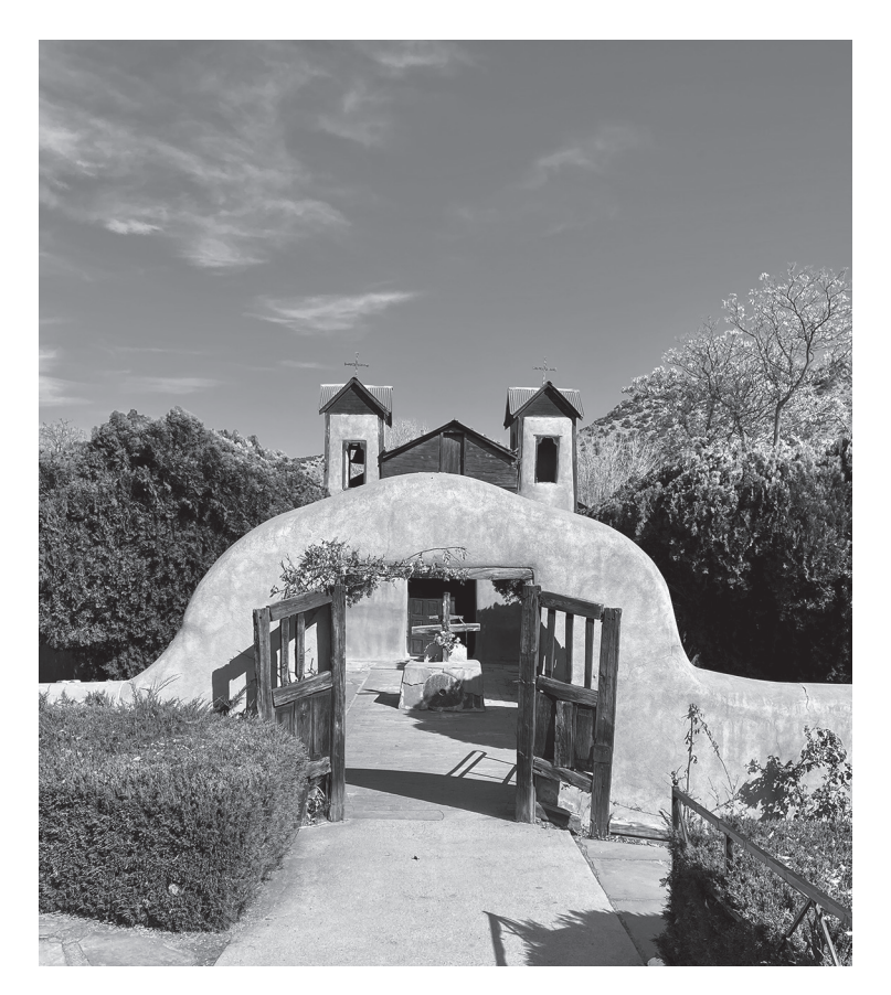
People come to El Santuario de Chimayó in New Mexico for dirt that's said to have healing properties.