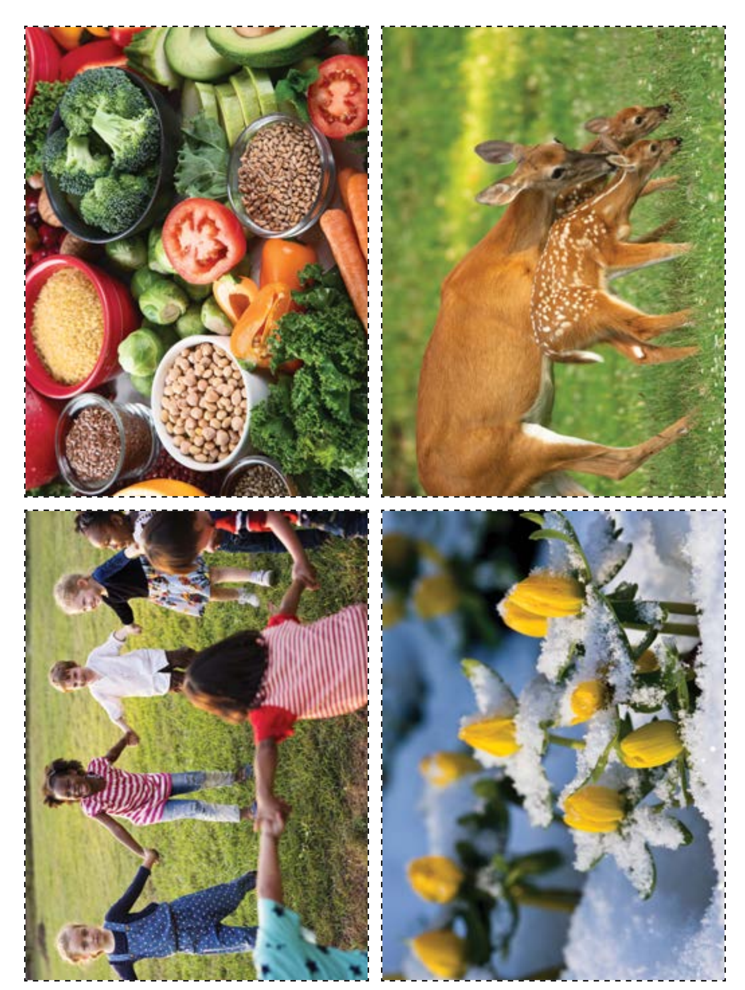
Young Children: Session 1—Appreciate God's Creation © 2024 Growing Faith Resources