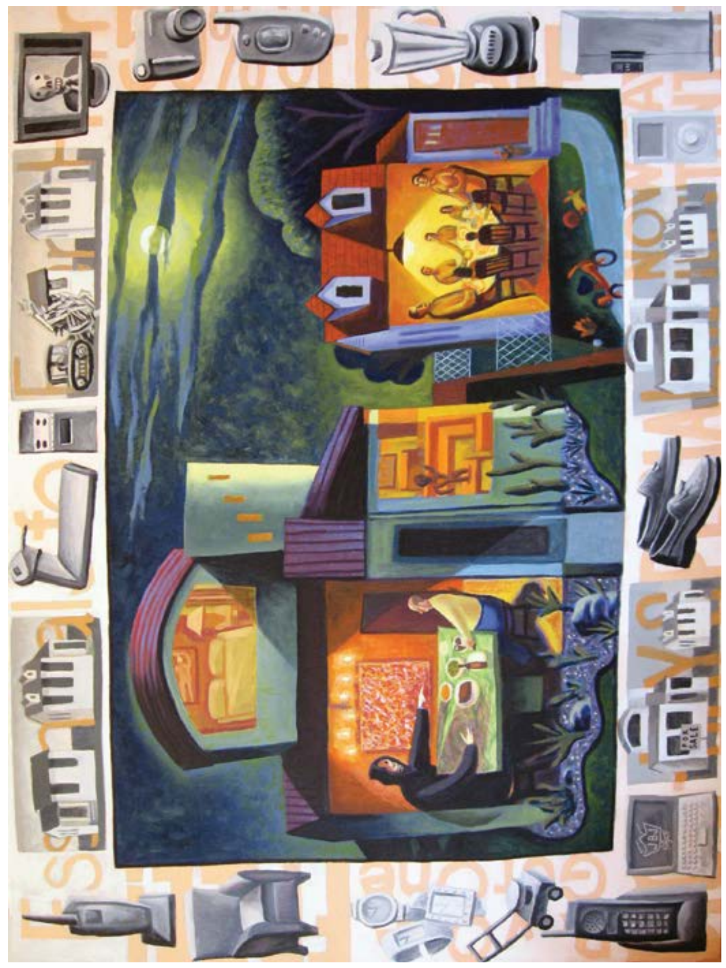
Rich Fool by James B. Janknegt, <u>www.bcartfarm.com</u>. Used with permission.

Multiage Children: Session 1—Be Finite © 2024 Growing Faith Resources