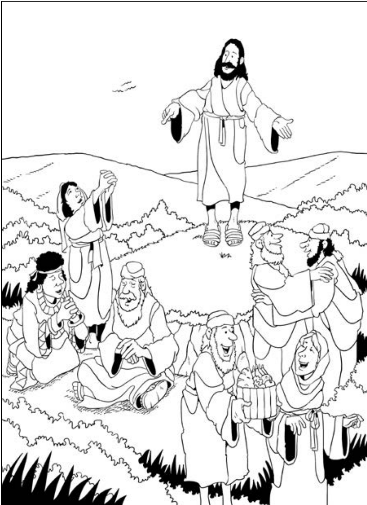
Jesus answers the question, "What is the greatest commandment?"