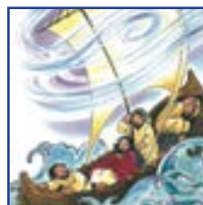
Calming the Storm Luke 8:22-25