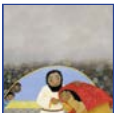
Jesus Heals a Woman on the Sabbath Luke 13:10-17