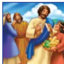
A Boy and His Lunch John 6:1-15